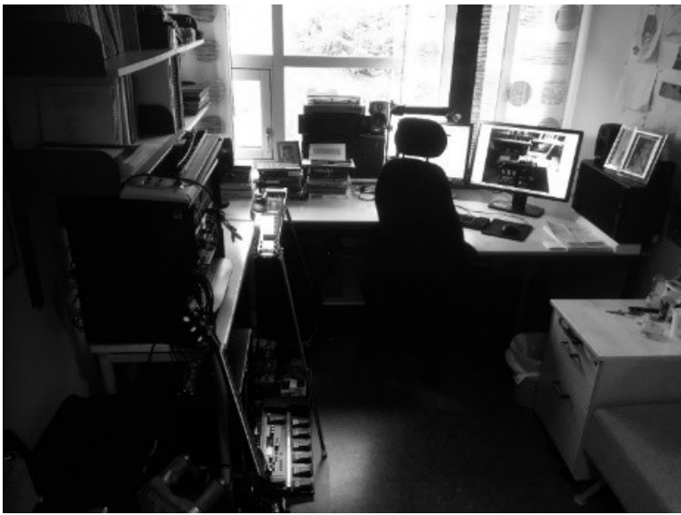
Figure 2: "The Researcher's Laboratory" Consisting of a Master Station and Writing Room in 8 m<sup>2</sup> office

plored throughout this study, an acknowledgment that may be relevant to others as well. Furthermore, I explored numerous variations of equipment and setups. Other limitations I explored were related to locations . I wanted to fully pursue the principles of operating by limitation and locations by establishing a master station at my 8 m2 office (see Figure 2). This constitutes some of the frames for investigating the concept of operating by limitation in this study.