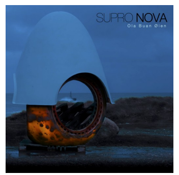
Figure 13: Cover art (Sand, 2018): "Supro Nova"

https://www.youtube.com/watch?v=s3kH5VHx_eE